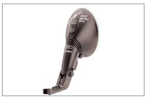
You switch on the hub generator light system with the integrated switch at the front light.

The light system with a hub generator is switched on electrically. For this purpose you will find a switch on the back of the rear light with three labeled switch positions. With the switch you can turn the lighting system ON, OFF or set it to SENSOR. In the SENSOR position a twilight sensor in the lamp turns the lighting system on and off automatically depending on the brightness of the environment.